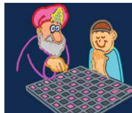
Figure 3. Doubling grains of wheat on a chessboard.

It is interesting and important to note that each square contains one more grain than all the preceding squares combined. This is true anywhere on the board. Note that when eight grains are placed on the fourth square, the eight is one more than all previous grains of wheat, the total of seven grains that were already on the board. Or the 32 grains placed on the sixth square is one more than all previous grains of wheat, a total of 31 grains that were already on the board. We see that in one doubling time we add more than all that had been added in all the preceding growth! To repeat for emphasis: In one doubling time more growth occurs than in all preceding growth combined!