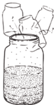
Figure 2. Hooray for the discovery of three times as much space!

Suppose that at 11:58 a.m. some far-sighted bacteria see that they are running out of space and launch a full-scale search for new bottles. Luckily, at 11:59 a.m. they discover three new empty bottles, three times as much space as they had ever known (Figure 2). Four bottles quadruples the total resource space. If they are able to migrate to their new habitats, will their problem be solved?