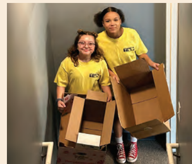
Youth help organize Joy's House during Northminster's Day of Caring in 2023