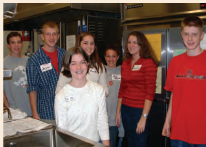
Youth-led Pancake Breakfast (early 2000s)