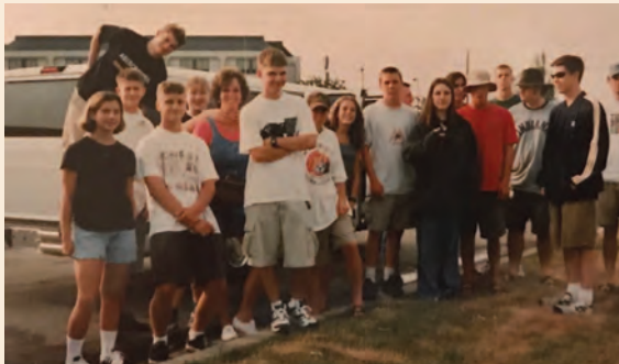
Youth Caravan of the 1980s