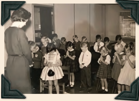
Sunday School, c. 1950s

Remembering the past helps us look to the future. Here are a few photos from the last 80 years of the ways we nurture our children. ◀