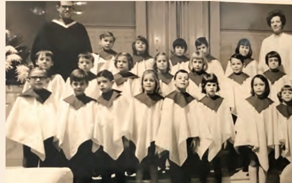
Childrens Choir of the 1970s