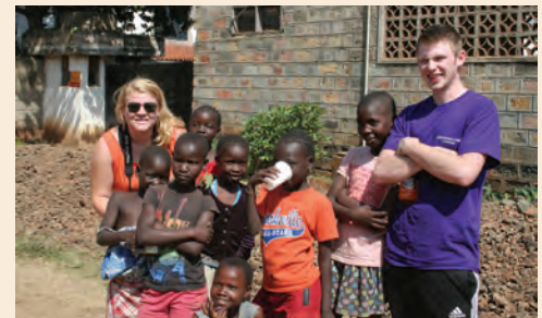
Youth joined the Northminster mission trip to Kenya in 2013