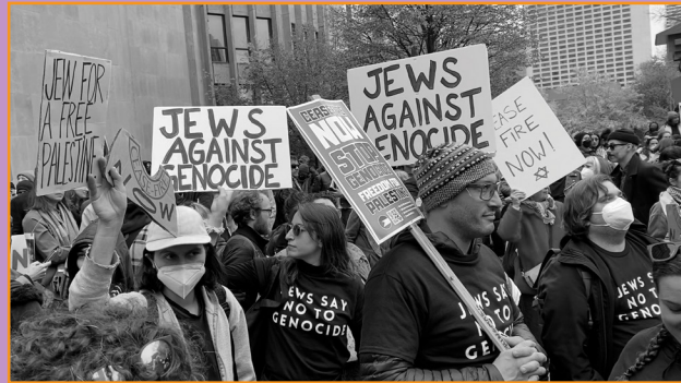
Letter to My Tribe (2024)