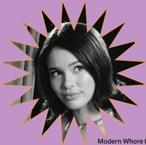
Modern Whore (2025)