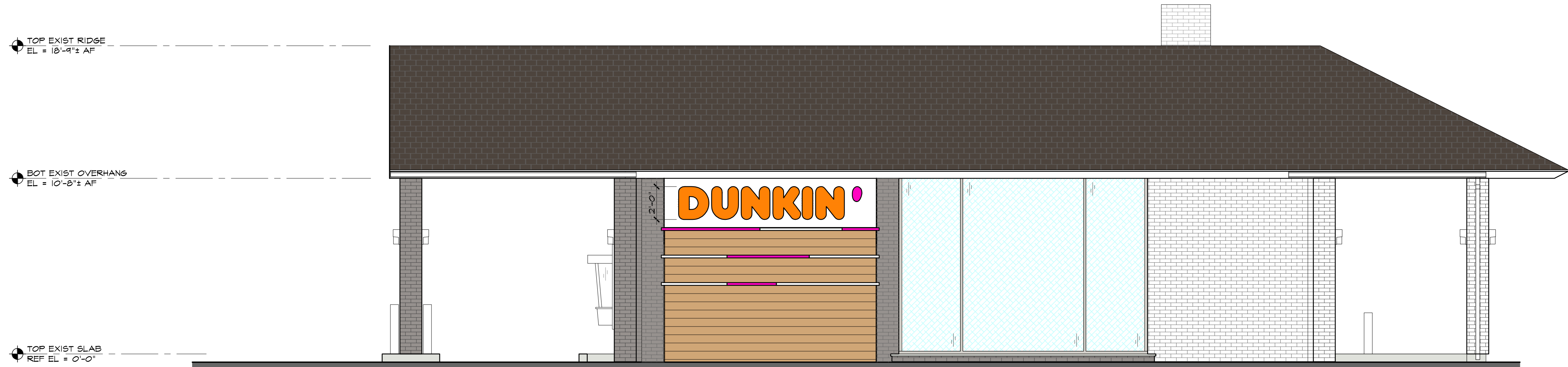
3 PROPOSED EAST ELEVATION SCALE: 1/4" = 1'-0"