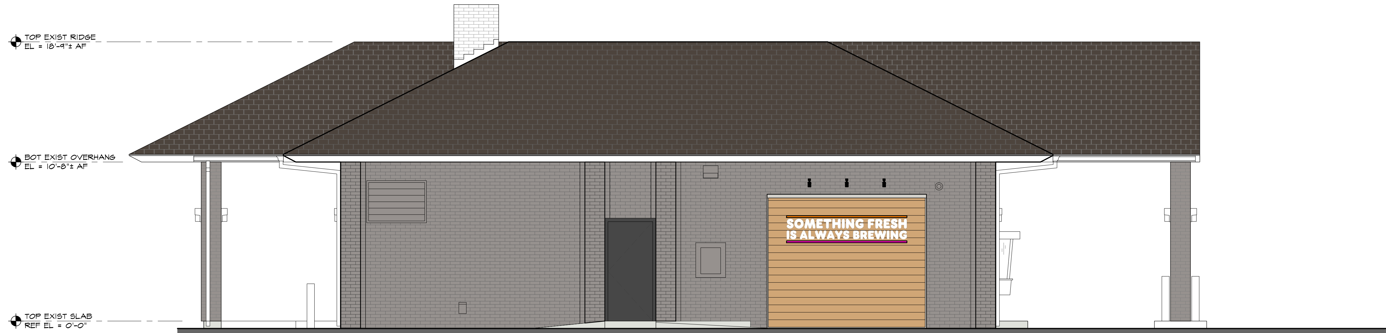
4 PROPOSED WEST ELEVATION SCALE: 1/4" = 1'-0"