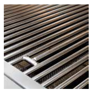
EXPANSIVE GRILLING SURFACE