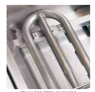
STAINLESS STEEL BURNERS