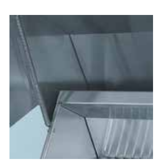
LYNX HOOD ASSIST