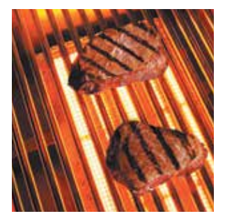
PROSEAR™ INFRARED BURNER

The Sedona by Lynx™ Series is always evolving to be the best at something new. That philosophy is reflected in its features. We've refined these features to give you a grilling experience that's both simple and stunning.