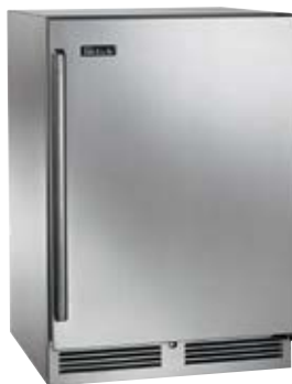
Solid Door Model