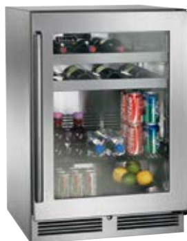
Glass Door Model