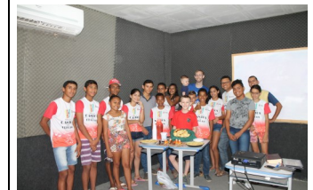
Thanksgiving with our English class

Sending Church: Agnew Road Baptist Church 400 Rainbow Dr. Greenville, SC 29617