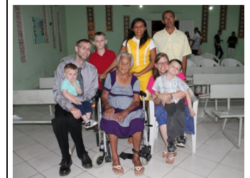
Anniversary Conference in Auiaba, Ceara