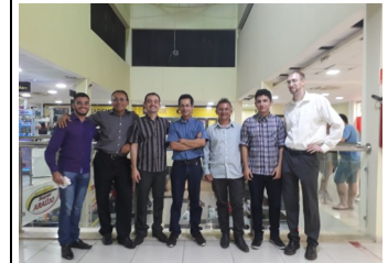
Men from Iguatu helping with evangelism and our Sunday services