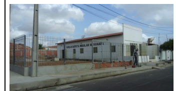
Maranatha Baptist Church fence construction project