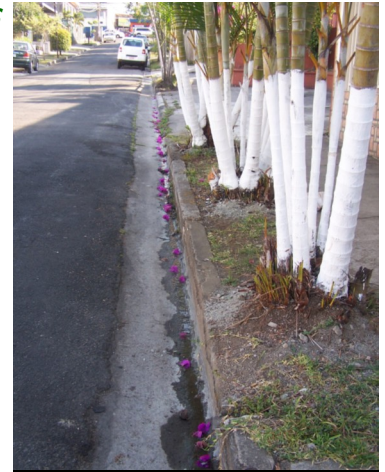
Our street, complete with laundry water in the gutter.

Now that we are leaving language school . . . we expect: