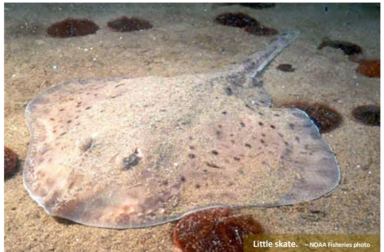
Little skate.

Answer: This objective was refined to be a more overarching statement focused on skate research. As updated, Objective 5 now states the Council will “promote and encourage skate research for critical biological, ecological, and fishery information based on the research needs identified and updated by the Council.”