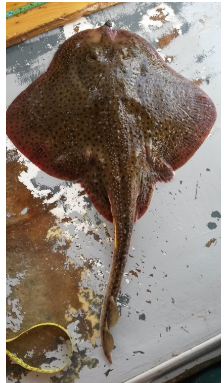
Tagged winter skate.

The Skate FMP's goal and seven objectives can be found on pages seven and eight of the original plan . Amendment 8 would update Objectives 2 and 5. The changes are intended to better reflect current conditions in the fishery, the status of the seven stocks in the skate complex, and the focus of skate research.