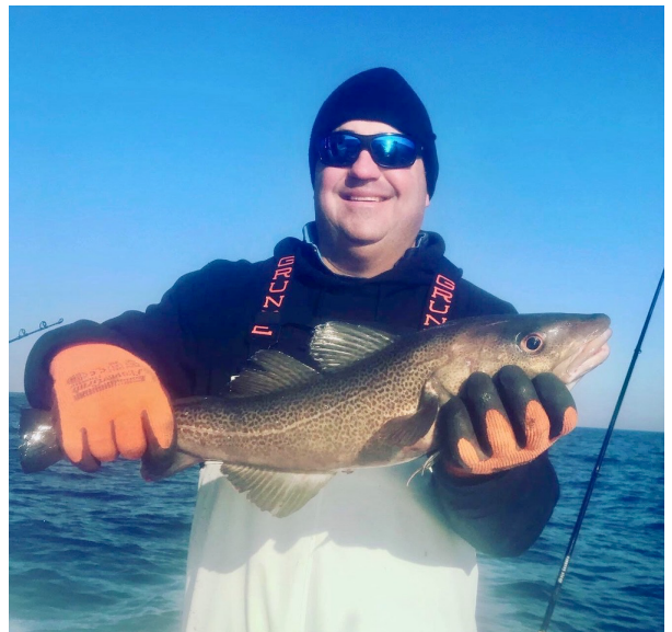
A happy charter boat client who caught this cod on Coxes Ledge in February 2020.

The Council will release more information shortly about how to provide comments in advance of the April meeting.