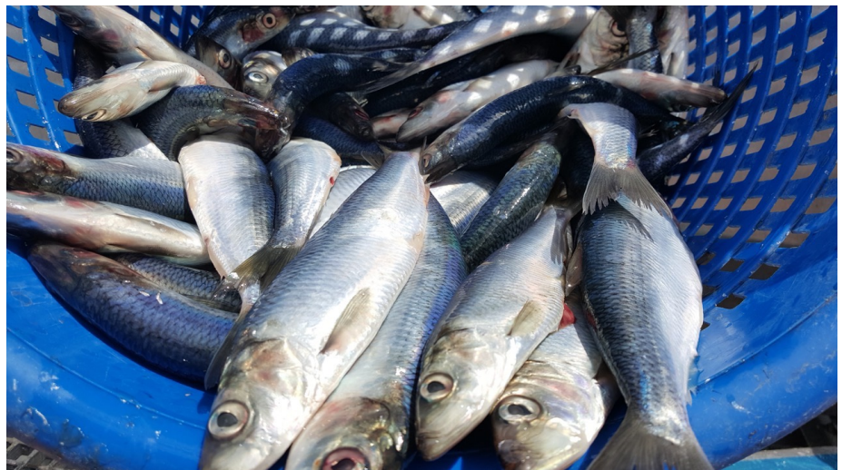
Atlantic herring.

View a Copy of the Presentation Summing Up Both Herring Frameworks HERE