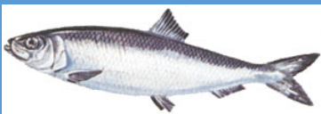
Atlantic Herring ( Clupea harengus ) – NOAA Fisheries graphic