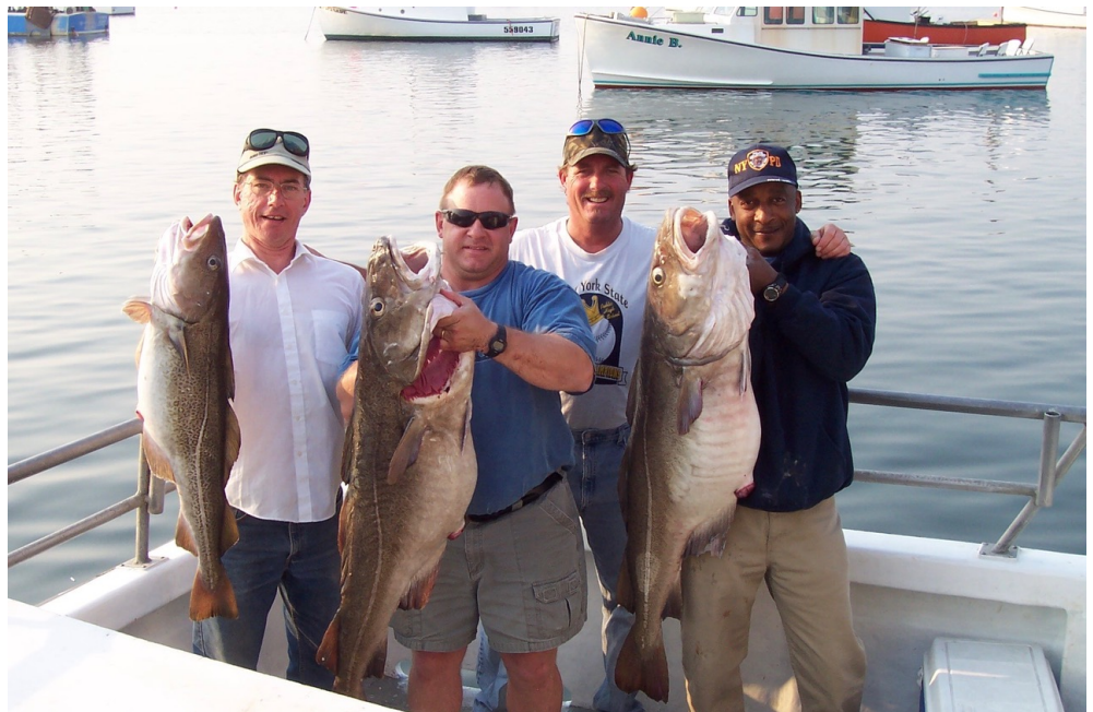
A successful recreational fishing trip aboard the Lady Tracey Ann, which sails from Eastman's Docks in Seabrook, NH. The large cod were caught in May 2007 on Jeffrey's Ledge in the Gulf of Maine.