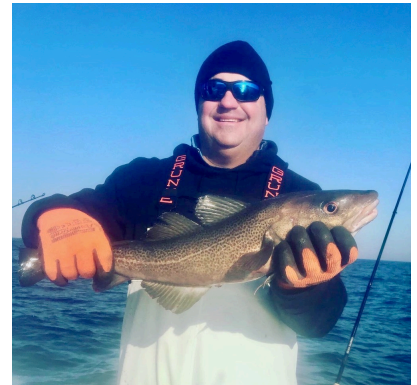
A happy charter boat client caught this cod on Coxes Ledge in February 2020.

The final workshop will integrate the discussions from the management workshop series and explore the highest priority management options. In particular, this workshop will focus on understanding socioeconomic impacts. While this is not a decision-making forum, it is a final opportunity in the workshop series to look across all potential management options that were suggested and provide feedback on how to evaluate those options. The desired outcome is to gain a better understanding of what information stakeholders think is important and how to evaluate tradeoffs.