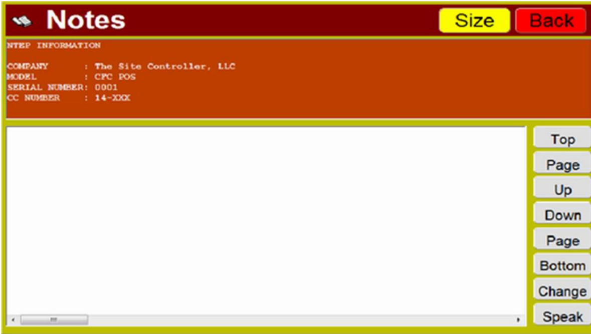
Screen Identification Badge