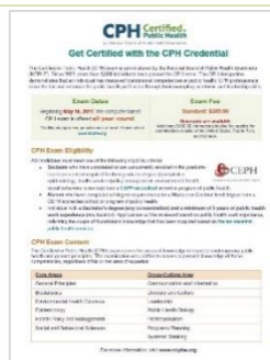
CPH Flyer (8.5x11 inches)