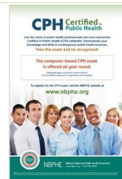
CPH Poster (11x17 inches)