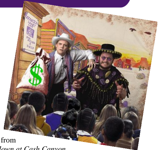
Scene from Showdown at Cash Canyon

Since 1978, The National Theatre for Children has dedicated itself to teaching young students about important and timely issues. As the largest touring theatre company in the world, our tested and approved methodology reaches two million students every year.