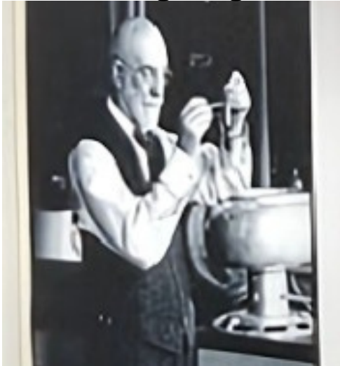
Stephen M. Babcock 1843-1931

Dr. Babcock, an agricultural chemist and Professor of the University of Wisconsin, developed the Babcock test in 1890. The Babcock test determines the fat content in milk and is still used today. Sulfuric acid is added to the milk in a Babcock test bottle and placed in a centrifuge. Everything in the milk, except the fat, dissolves in the sulfuric acid. The fat floats to the top and is measured by the graduations on the bottle.