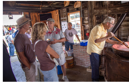
Stirring the Cheese