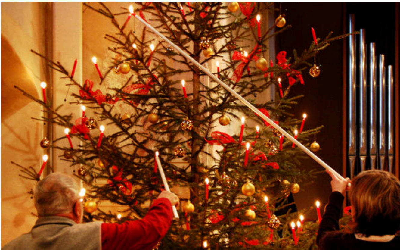
Christmas tree in Switzerland

We wish you all a wonderful Holiday Season! May you all be blessed now and in the coming year. We look forward to seeing you next Spring.