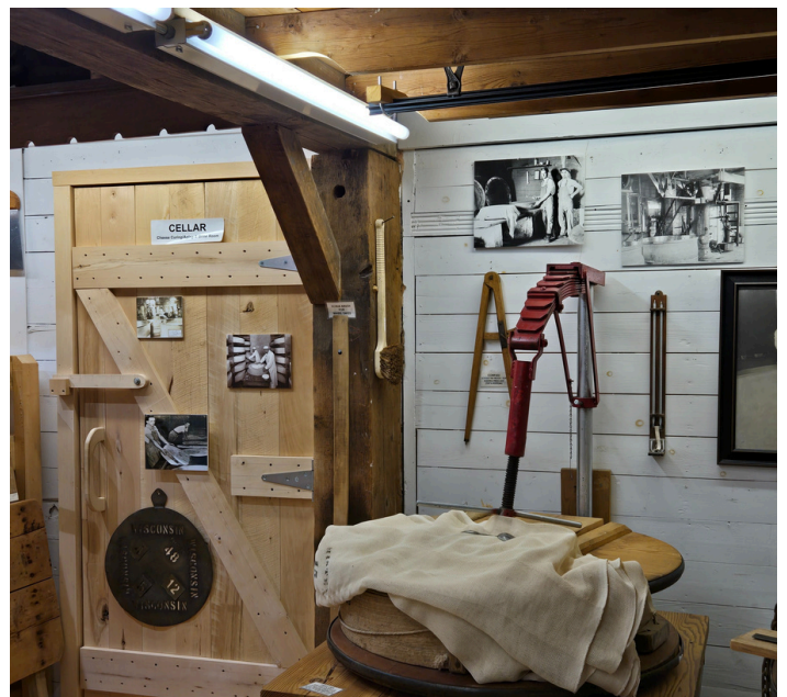
Cheese press and cheese cloth