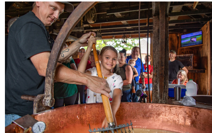
More, stirring the Cheese