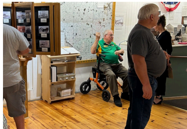
Guests touring the museum