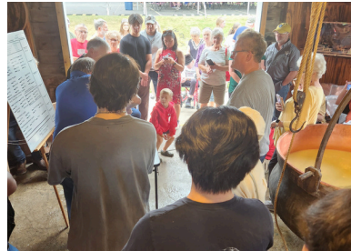
Viewing the cheese grading demonstration