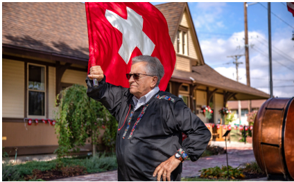
Swiss Flag thrower