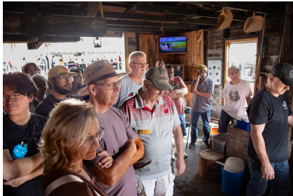
Viewing the cheesemaking demonstration