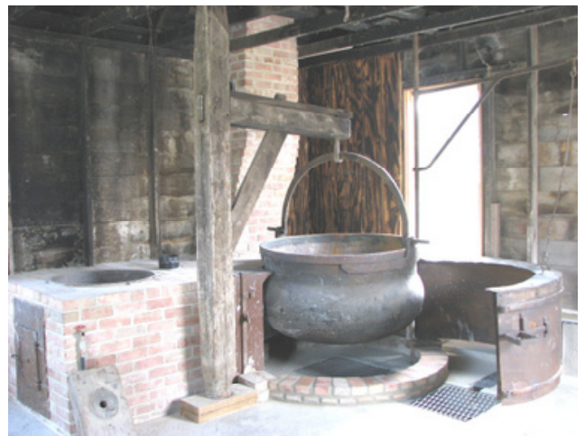
IMOBERSTEG CHEESE FACTORY

.....Recalling an era that was, And will never be again!