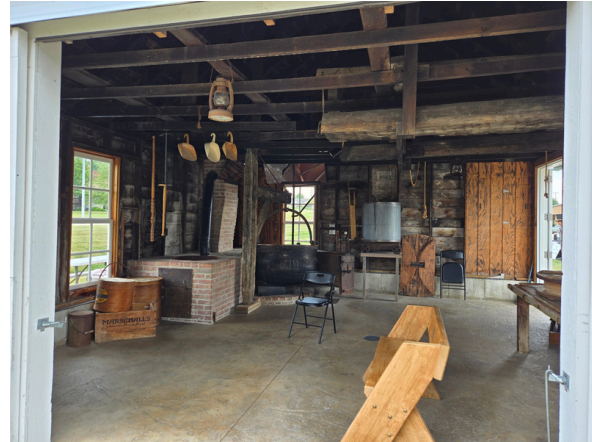
Emptied the factory to make room for the cheesemakers making the 90 pound wheel of Swiss