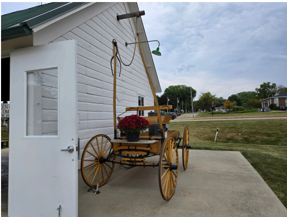
More beautiful mums for the day