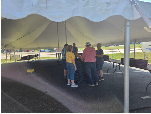
Volunteers and Spouses helping with preparations

A HUGE thank you to volunteers for all their hard work and time in getting the Center ready for the Anniversary Celebrations. We could not have managed without you!!!!