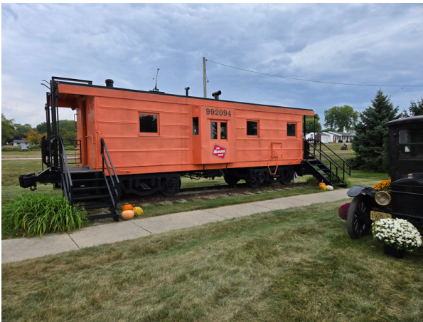
Decorated the Caboose with fall decor for the Day