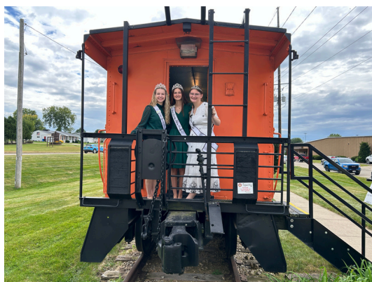
Green County Dairy Royalty