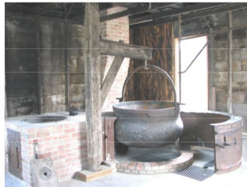
IMOBERSTEG CHEESE FACTORY

.....Recalling an era that was, And will never be again!