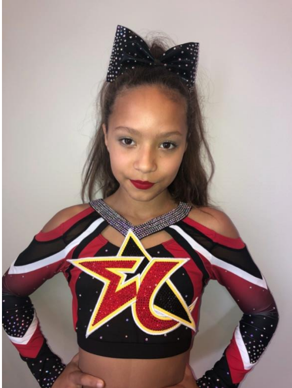
Makeup is natural and very simple Hair pulled back high pony NO side whisps