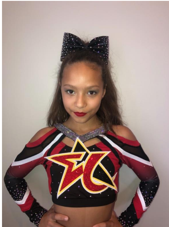
Makeup is fuller with hair slightly teased