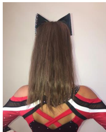
BACK for EVERYONE