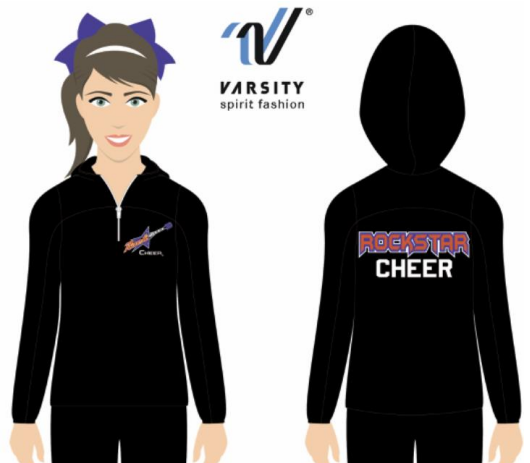
Warm Up Jacket