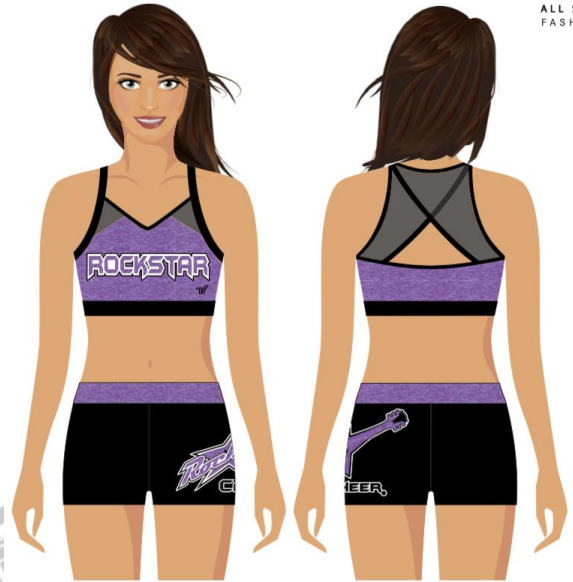
Full Year Uniform