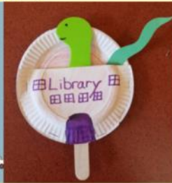
Peekaboo Leilong Craft