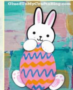
Bunny and Egg Craft