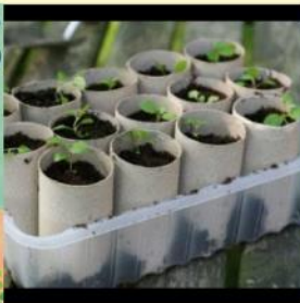
Decorate & Grow Seed Starters