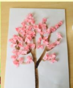
Cherry Blossom Tissue Paper Craft