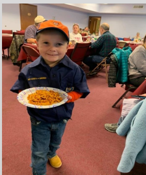
2019 Scout Spaghetti Dinner raised money for activities and church roof

A third of respondents are "willing to meet to plan" the future, but that was before COVID-19. While some things are on hold, we can each do our part worshipping in person or remotely, inviting people to church or online worship, sharing our newsletter to tell our story, making community connections and staying in touch with each other providing material, spiritual and emotional support. We can give to missions and donate to operate and maintain the church so it is ready for greater service when normal times return. We can keep planning and imagining what God wants FUMC to be in Nelsonville, Ohio.