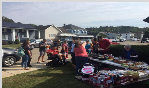
2019 Rally Day with the neighbors