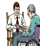
Driftwood Convalescent HOME MINISTRY