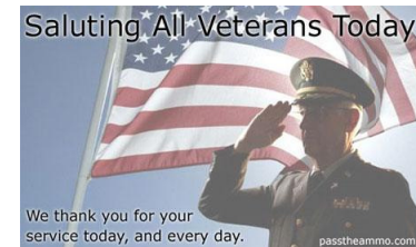
Saluting All Veterans Today We thank you for your service today, and every day. passtheammo.com