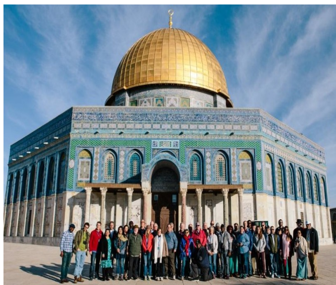
Dome of the Rock, Temple Mount