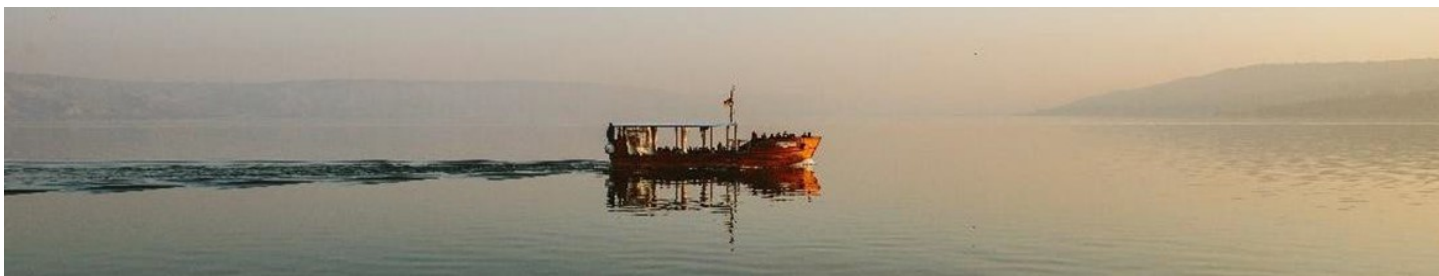
Sailing on the Sea of Galilee