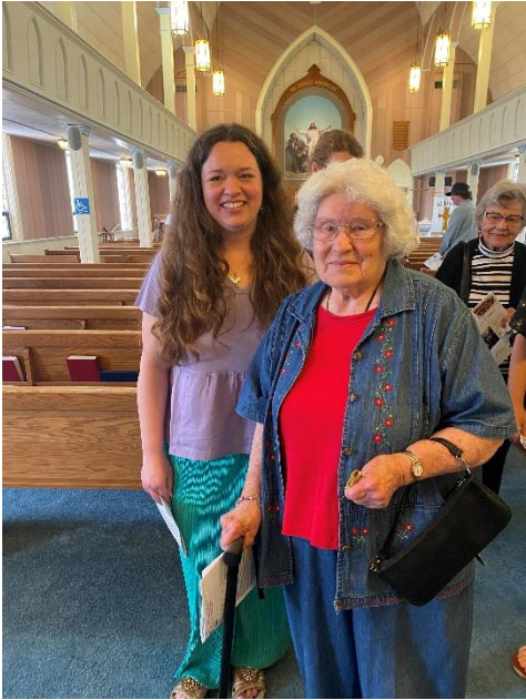
Special Friends reunite!