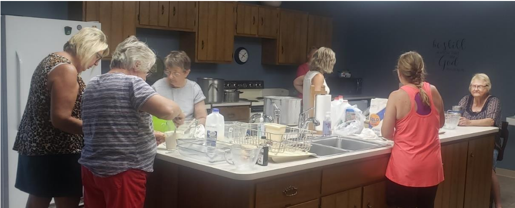
Ostakaka making by the pros!