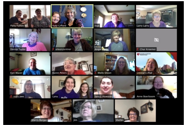
Some of the Zoom eventparticipants.

Thanks to all who were a part of Seek and Serve Day: Home Edition!