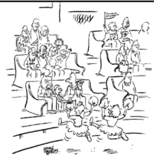
"It was nice of the church to donate these old pews to the high school."