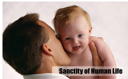
Sanctity of Human Life Sunday- January 19, 2014