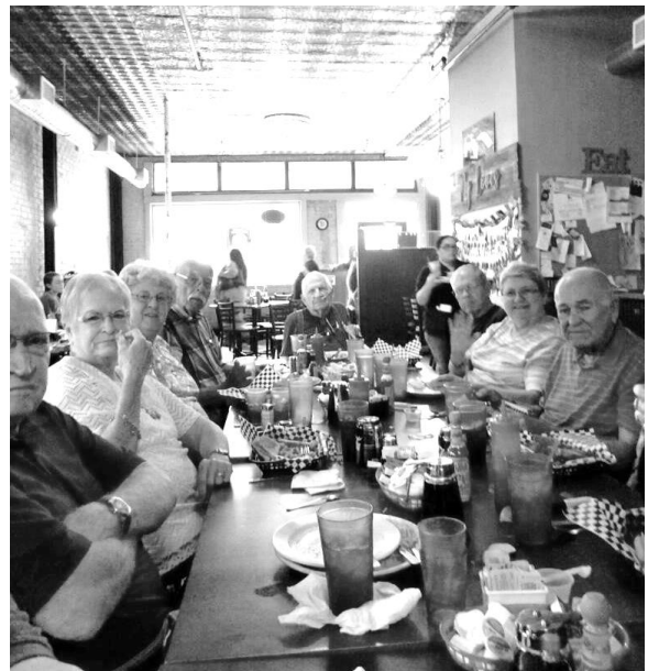
Last Friday night's Supper Club was at My Love's Restaurant in Forney - good crowd! Join them next Friday at Yellow Rose in Terrell!