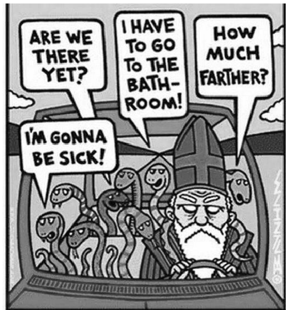
St. Patrick driving the snakes out of Ireland.