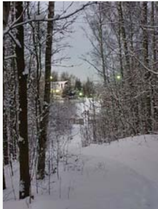
The winter path to the Evangelical Lutheran Church of Ingria Theological Institute. Koltushi, Russia