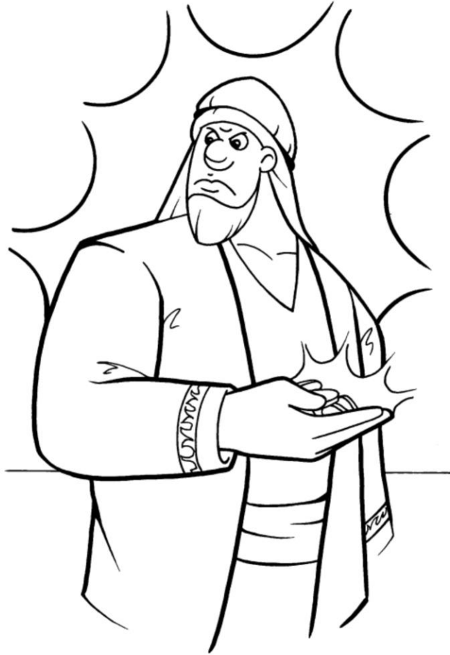
Parable of the Talents (Matthew 25:14-30)