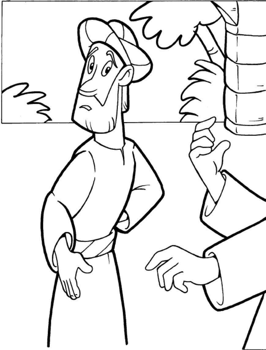
The Rich Young Ruler