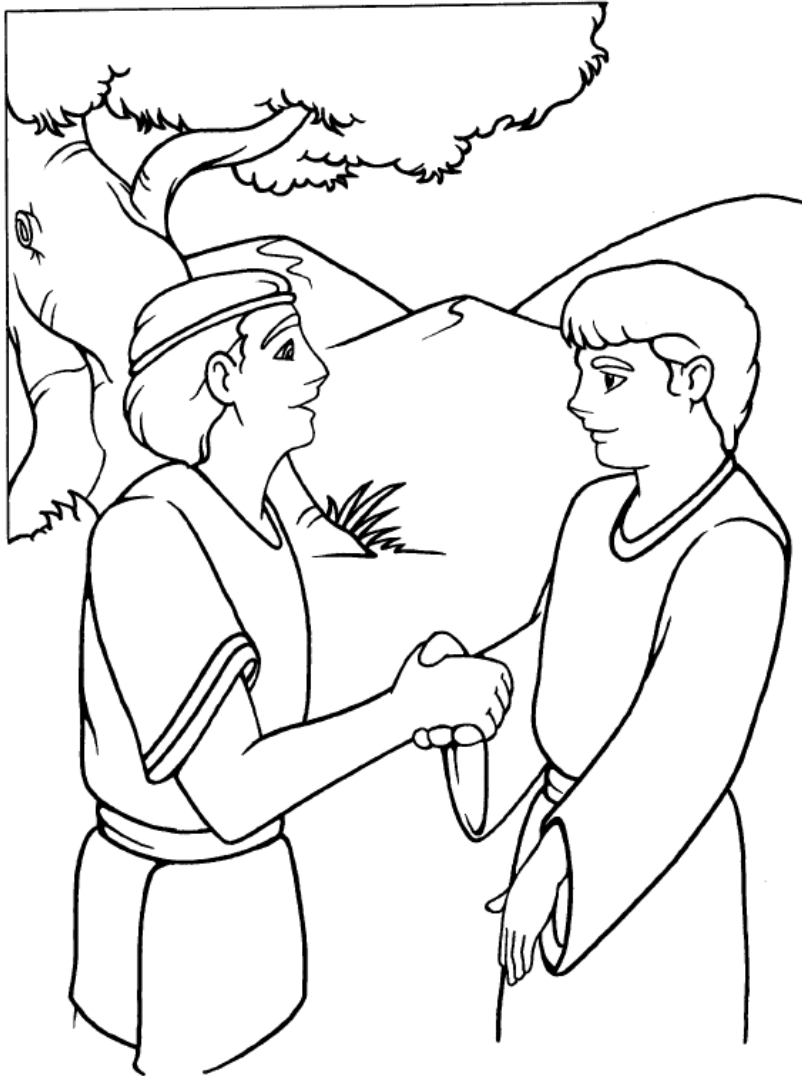
Esau Sells His Birthright to Jacob Genesis 25:19-34