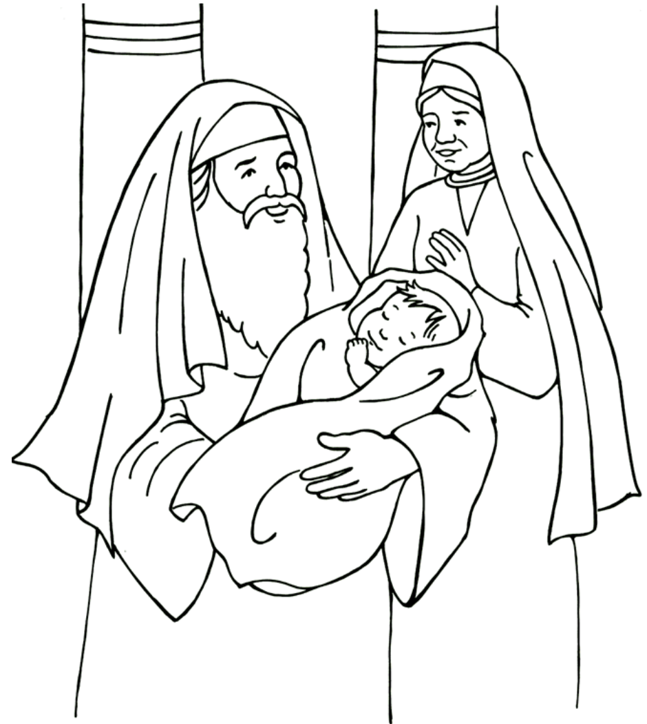
Simeon and Anna Thank God Luke 2