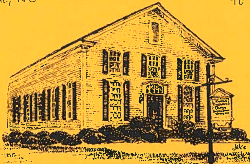
Ramah Presbyterian Church - ORGANIZED 1783 -