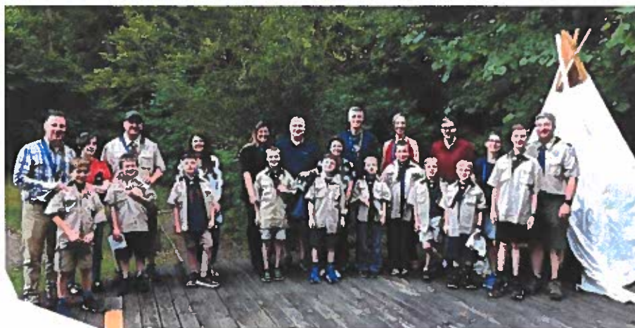
Bears bridging to Webelos I