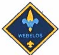
Webelos (4th & 5th Grade)