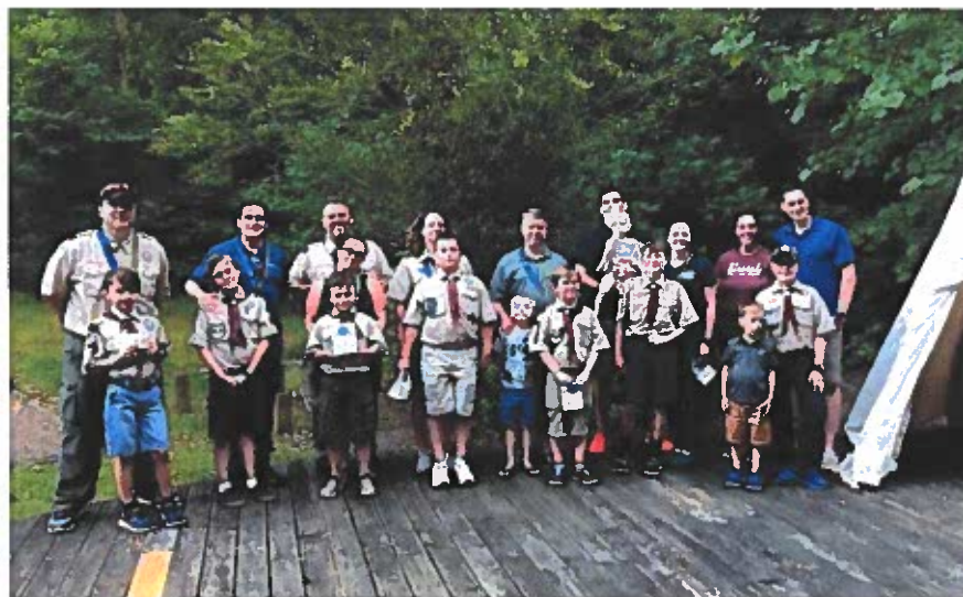
Webelos I bridging to Webelo II