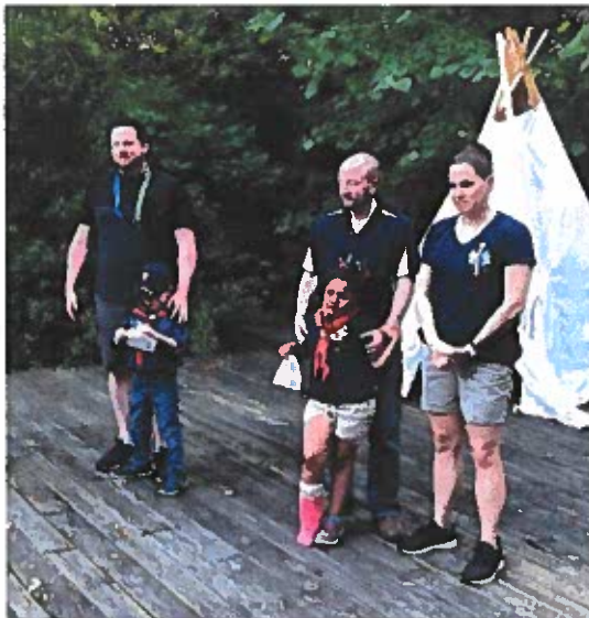
Lions bridging to Tigers