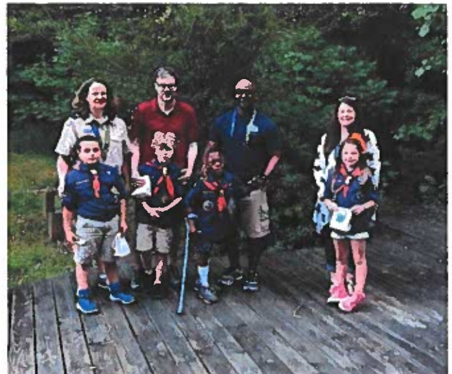
Tigers bridging to Wolves