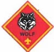
Wolves (2nd Grade)