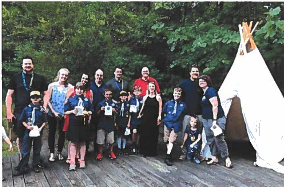
Wolfs bridging to Bears