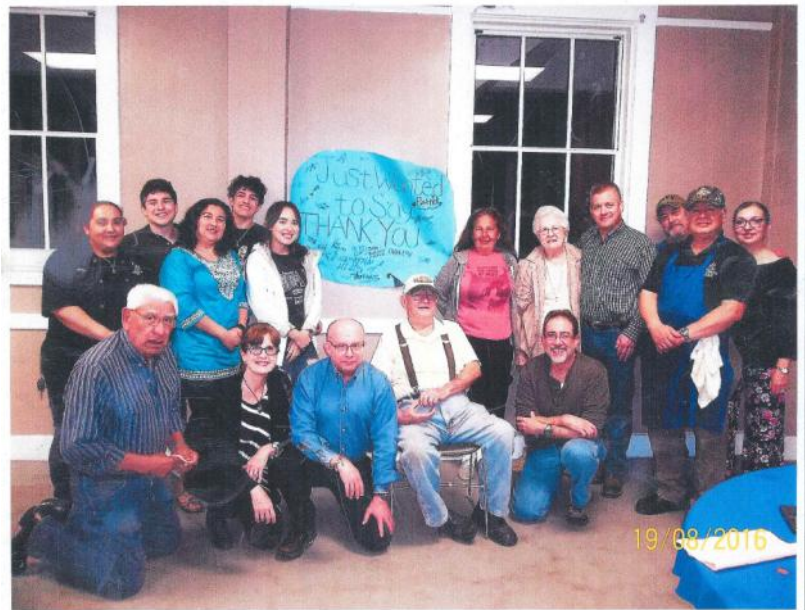
Thank You to this group that help serve St. P.J.'s Children's Home!

Are you being called by our Lord to be involved on some level with the Christian Men's Fellowship (CMF) Ministry ? As a Member of Western Hills Christian Church, you are automatically a member of CMF! We encourage you to pray about this! If you feel compelled in your heart too, please join us at our next Monthly Meeting - Noon on April 14 at " De Wese's Tip Top Cafe - 2814 Fredericksburg Rd. 78201 (210) 732-0191 for fellowship.