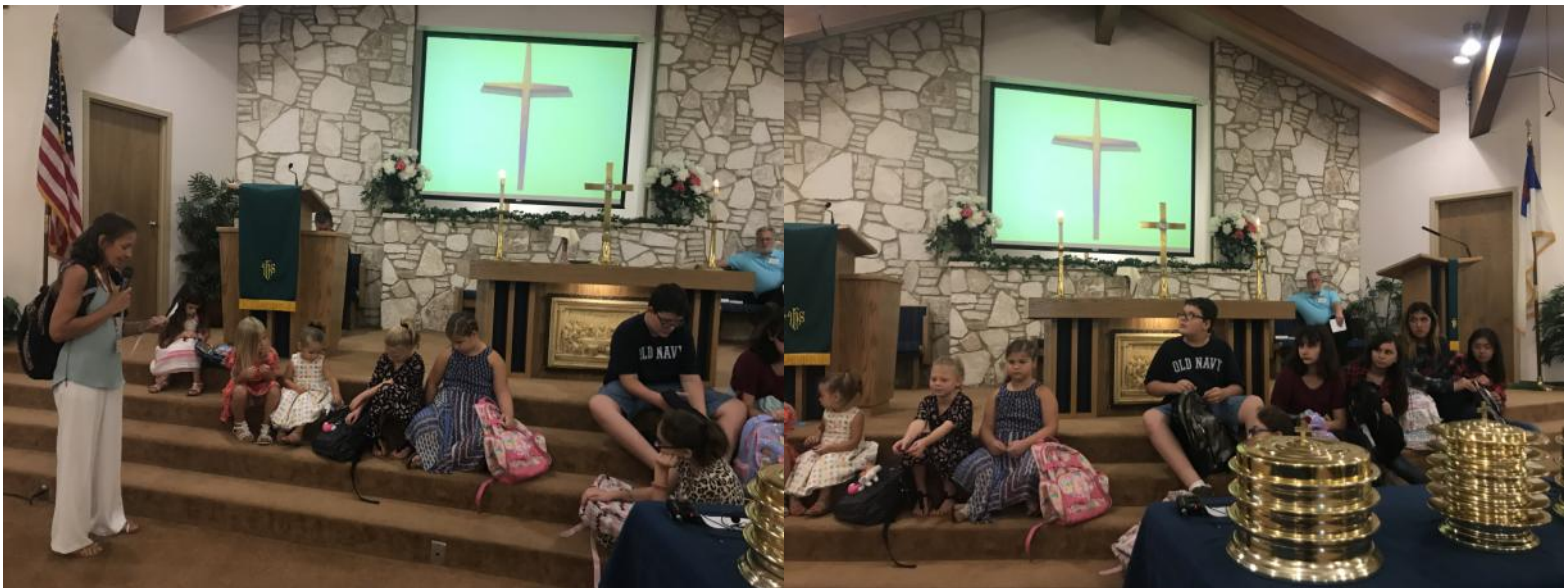
Blessing of the Backpacks