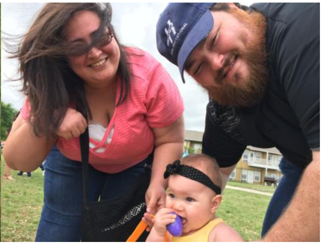
Fun at the Easter egg hunt.