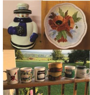
A little sneak peak

In lieu of the Christmas bazaar "Grandma's Attic" sale, we have decided to have a fall yard sale on Saturday, September 14th from 9:00 to 2:00 . There will be items on the lawn, but also things for sale on tables inside the church. From the looks of the present supply of donations we think there will be lots of interesting things to choose from!