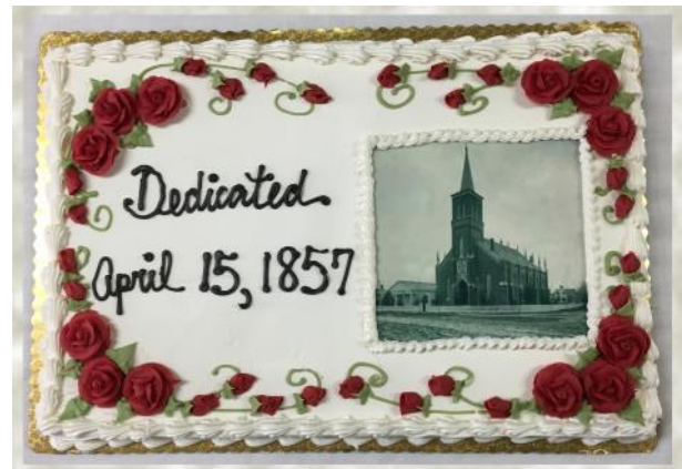
Celebration Sunday Cake