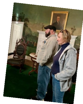
Visiting the "Strangers' Hall" for visitors to the Campbell House