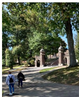
The old main gates at Bethany College