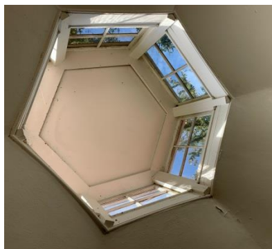
"All light comes from above" in Alexander's study