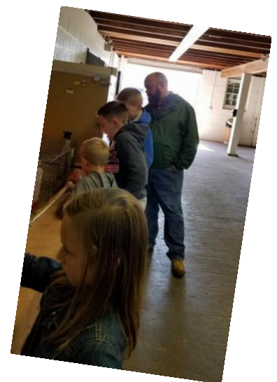
Visiting with the animals