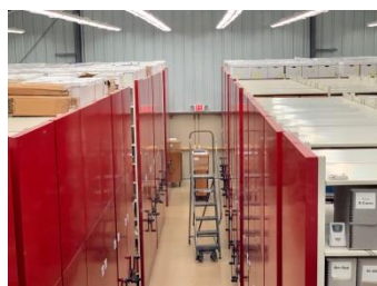
The stacks of bulletins, articles, biographies, music, pictures and so much more in the archives of the Disciples Historical Society