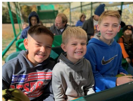
Riding on the hay wagon!