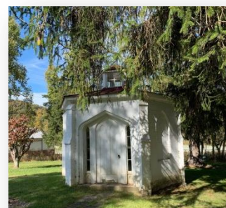
Alexander Campbell's study, close to (but separate from) the main house