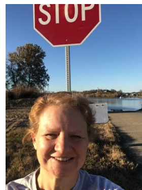
Waiting for the Ferry

On a more personal note, between the 9 hour gathering on Saturday for Convention (which is available on the Diocese of Indianapolis YouTube channel) and the church gatherings on Sunday, my post-concussion brain had had enough of screens. So yesterday afternoon, my husband and I spontaneously drove north of Marion, KY to ride the free car ferry across the Ohio River to visit Cave-in-Rock, Illinois. It was a beautiful drive and a great experience. And it was, by definition, a safe, socially distanced, adventure. I share this with you as a dare: I dare you to have one safe adventure while the weather is still cooperating and share it with the rest of us at an upcoming Coffee Hour.