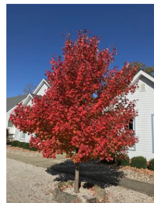
October Glory Tree dressed in Red and Orange