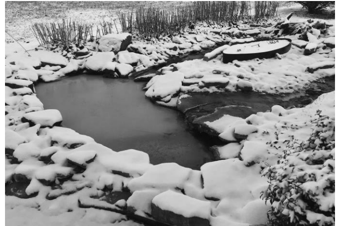
Despite the cold, life-giving water still flows, if we look long enough to see it.