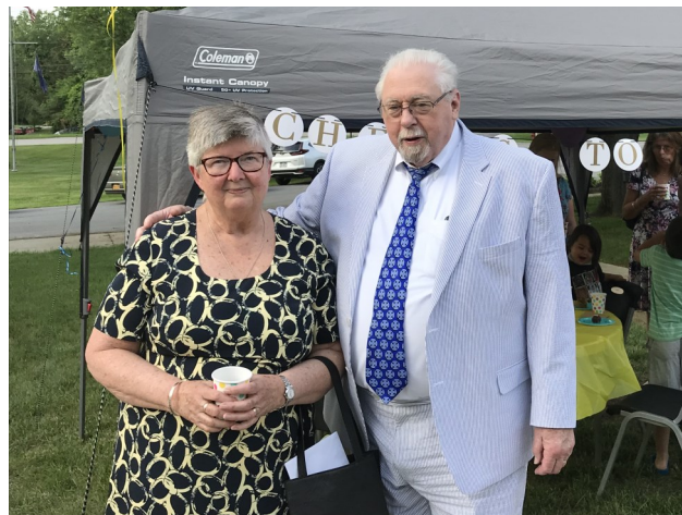
Cheers to 50 Years!