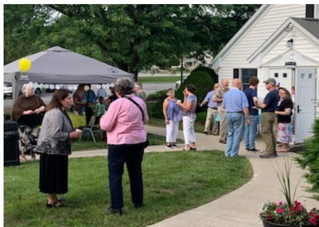
More Summer Mixer on the Green