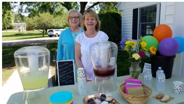
Summer Mixer on the Green