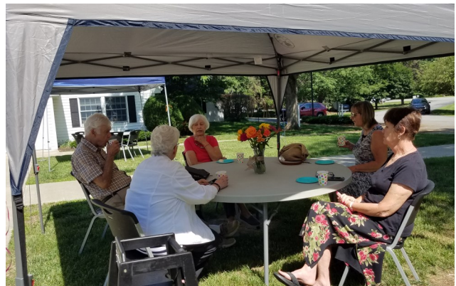
Enjoying Summer Mixer See more photos on page 2