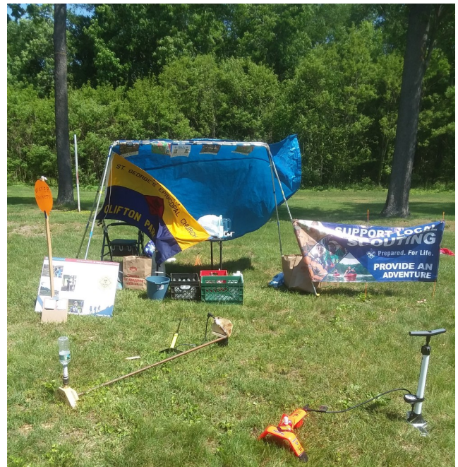
Shen Scouts Fun Day

Anyone interested in scouting can go to www.beascout.org and find Pack 4043. Another den of Cub Scouts will be making it to the rank of Eagle in August. St. George's can be so proud of playing a part in producing these awesome youth leaders who go on to be presidents, astronauts and other important leadership positions because they were rounded out and challenged by the Scouting program.