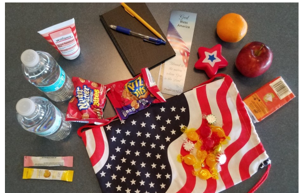
Welcome Home Initiative welcome bag gifts

See our web page: https://www.stgeorgescp.org/veterans_retreats .